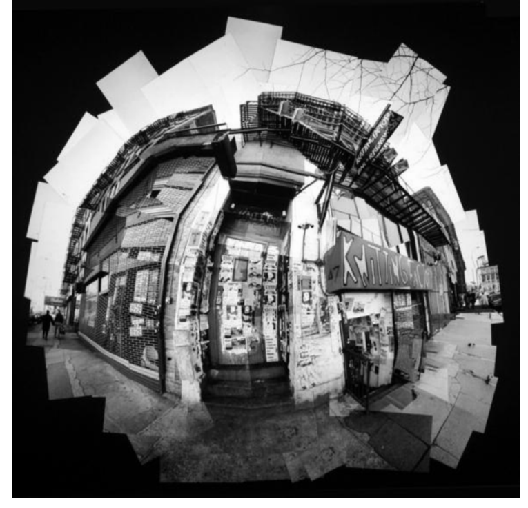
Album art--Live at the Knitting Factory

"I was very lucky - to my surprise, the commercial work kept coming. I